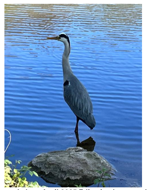
Lawn Lakes, April 2025